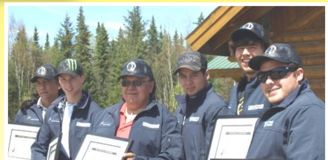
FIRST NATION GRADS START WORK IN MINING - PG 5