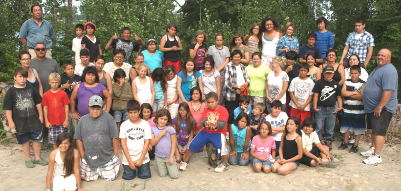
JUNIOR WEEK FOR THE WABUN YOUTH GATHERING IN ELK LAKE SAW A LARGE TURNOUT OF BOYS AND GIRLS BETWEEN THE AGES OF EIGHT TO 12 TAKE PART IN WORKSHOPS AND ACTIVITIES. PICTURED ARE WABUN YOUTH, JUNIOR CHAPERONES AND CHAPERONES.