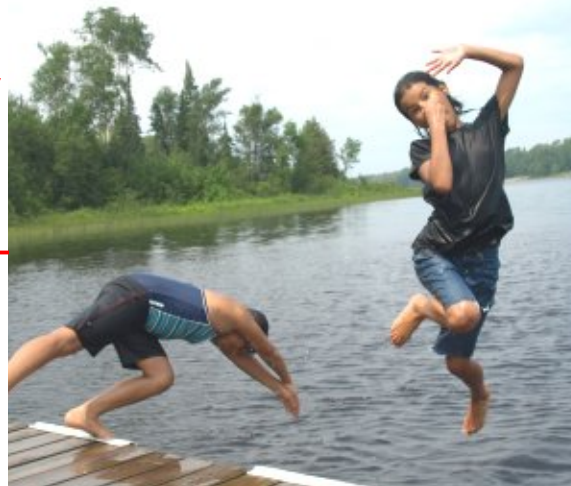
DIVING INTO ELK LAKE DURING THE WABUN YOUTH GATHERING JUNIOR WEEK FOR AGES 8 TO 12.

The event was divided into two parts. The first week from July 18 to 22 was held for junior youth aged from eight to 12 and the second week from