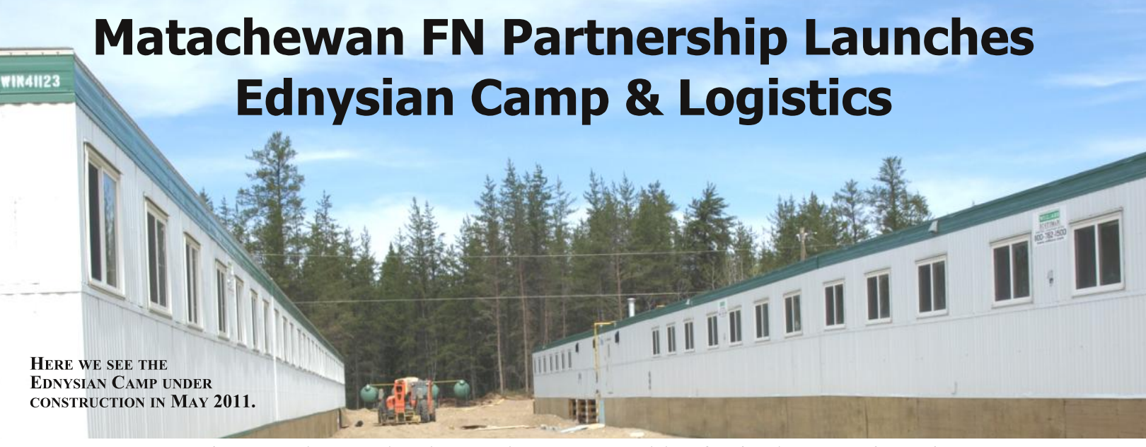
Matachewan First Nation is creating opportunities for business and employment with the construction of the Ednysian Camp and Logistics, a new mining camp that will provide accommodation services for Young Davidson Mine employees.

The First Nation is majority owner of the new enterprise in association with Morris Modular Space Ltd, a company based in Sudbury which specializes in modular buildings for the commercial industrial and con-