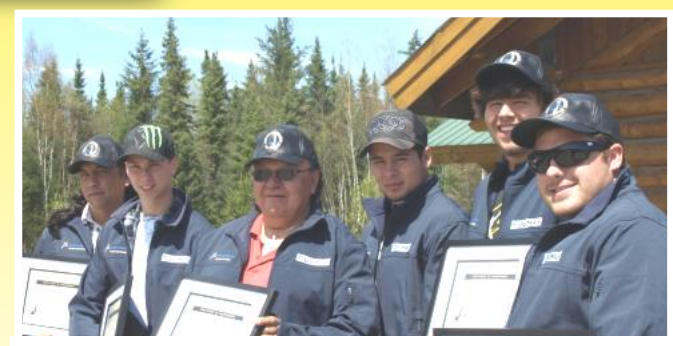
FIRST NATION GRADS START WORK IN MINING - PG 5